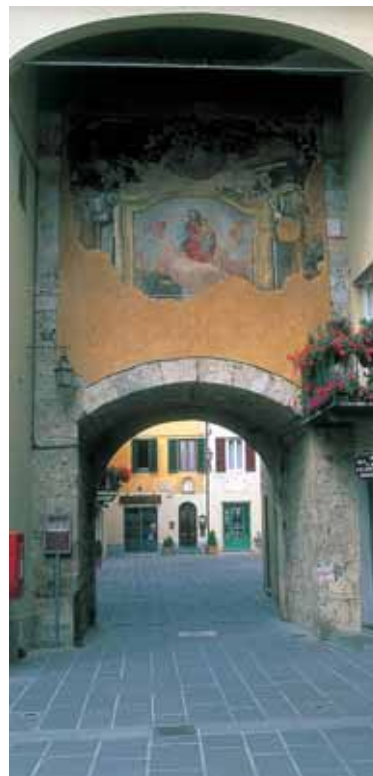
Camaioire, Porta San Pietro

Forte dei Marmi - It is the most recent municipality, having been founded in 1914. Its territory borders Marina di Pietrasanta in the south and stretches up to Cinquale in the northern part. The modern area is built around its small historic centre near the fort , dating from 1782. Today, its pier stretching out into the sea for about 100 m, is frequented by strollers and fishermen but in the past was used for transporting marble from the Apuan Mountains. On clear days a breathtaking scenery of the sea and mountains can be enjoyed from here and the Apuans seem almost to soar above the sea. Today it is a very popular destination for tourists from all over the world. In the 1930s the Agnelli family chose the town for their summer residence making it famous and starting a trend for many other wealthy industrial families com-