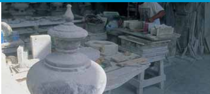
Detail, marble crafting Atelier