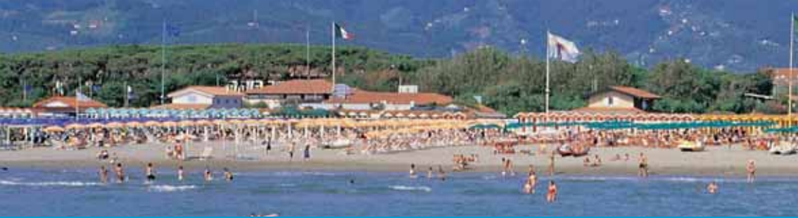
View of Forte dei Marmi from the pier towards the mountains Marina di Pietrasanta, the beach Viareggio, the beach

fering a wide variety of habitats, from the lush coastal pine wood to the salty swamps and lake. Both nature parks are ideal for people of all ages and families and can be enjoyed the whole year round. Furthermore, sea lovers can enrich their holidays consisting in dolphin and whale-watching cruises to the Cetacean Sanctuary, a water reserve located along the Tuscan Archipelago and the northern Tyrrhenian Sea – where