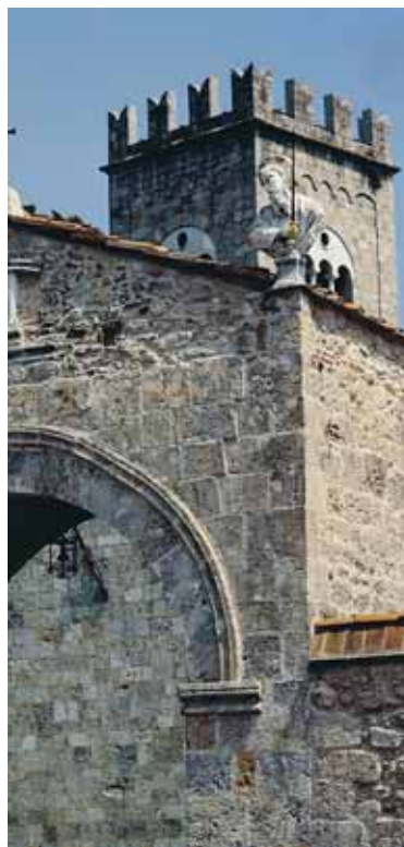
Camaiore, detail of the Badia di San Pietro previous page Pietrasanta, the Duomo