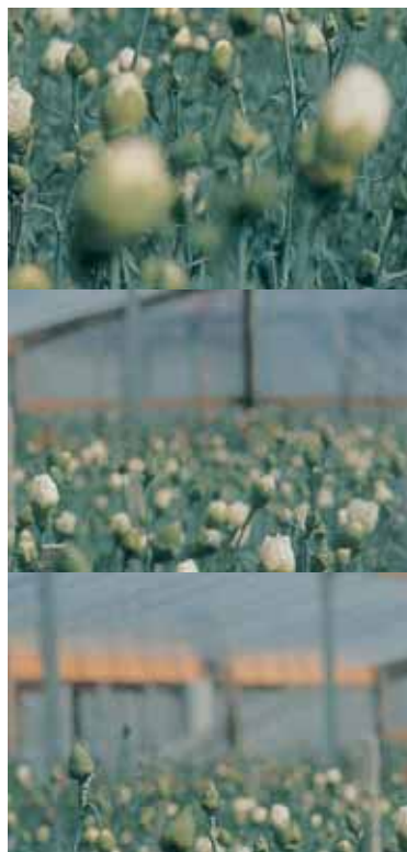
Flowers in Versilia, details previous page Excursionists on monte Croce, with a background of La Pania

Versilia claims countless opportunities to enjoy sports and recreational activities, ranging from hiking to horseback riding, to sailing and windsurfing or even taking part in regattas. A wide choice of sports is available, from swimming to playing tennis or golfing, thanks to the numerous swimming pools and sports centres available in the area. Moreover, you can enjoy sea and lake tours with a wide range of destinations. Every year Versilia plays host to important sporting events such as the Viareggio International Youth Football Tournament and Indoor Tennis Tournaments held in Forte dei Marmi as well as the Gran Premio Città di Camaiore for professional cyclists.