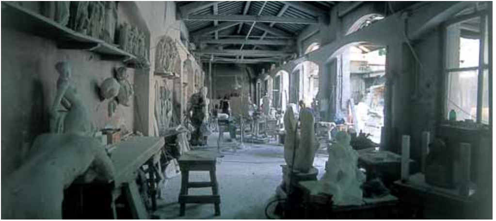
Pietrasanta, atelier of artist of marble