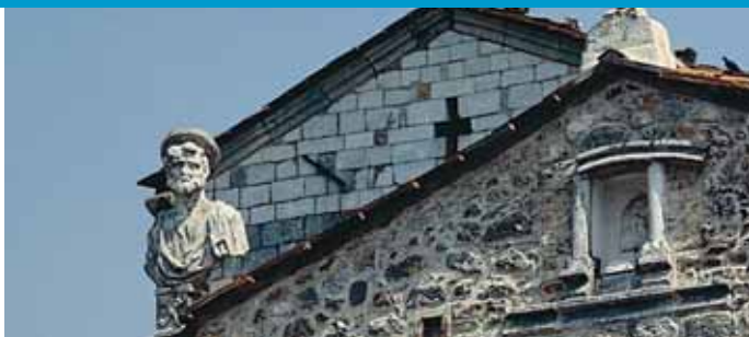
Camaiore, detail of the Badia di San Pietro