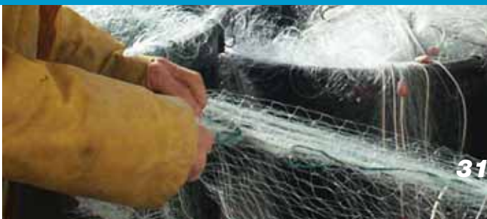
Olive-grove nestling in the Massarosa hills Fishing scene