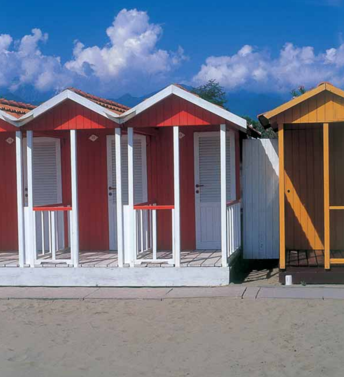
Multicoloured beach cabins at Forte dei Marmi