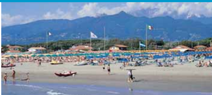
Forte dei Marmi, the beach